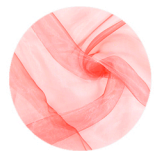
COURTAIN Organza 35 (RED) www.tkaniny.net