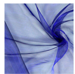
COURTAIN Organza 28 (BLUE) www.tkaniny.net